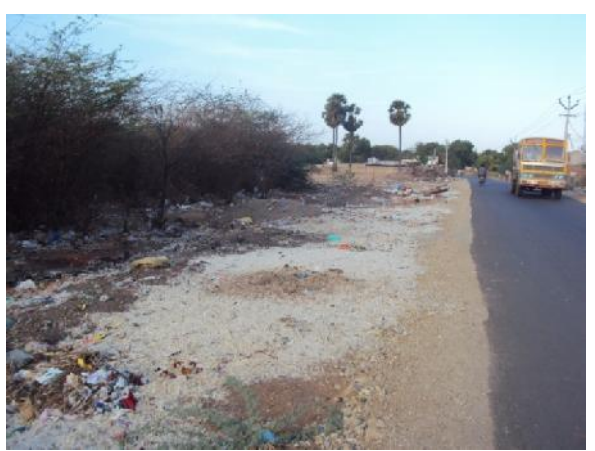
Plate: Mapillaioorani Main Road