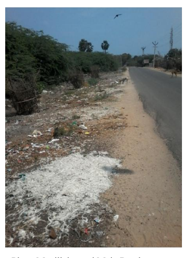
Plate: Mapillaioorani Main Road