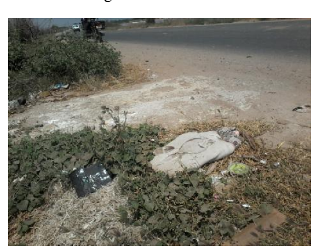
Plate: East Coast Road