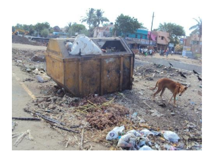
Plate: Anna Nagar Main Road