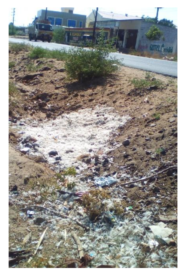
Plate: Meelavittan Road (Near by 4<sup>th</sup> gate)