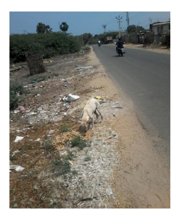
Plate: Mapillaioorani Main Road