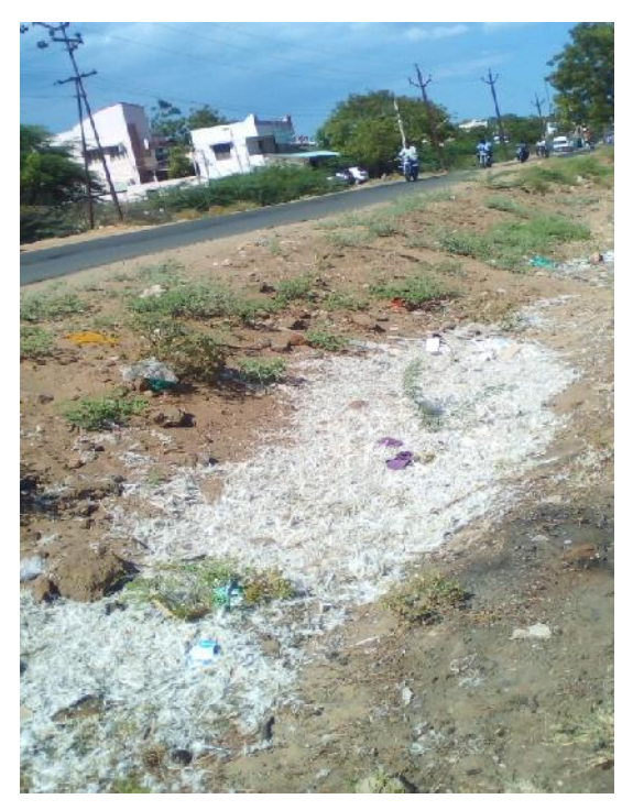
Plate: Meelavittan Road (Near by 4<sup>th</sup> gate)