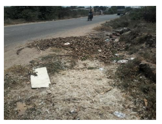
Plate: East Coast Road